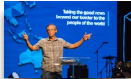
YTD INDICATED DECISIONS 14,201,056