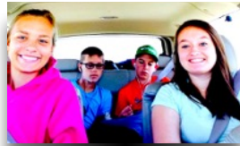
ROAD TRIPS ARE ALWAYS BETTER WITH FRIENDS