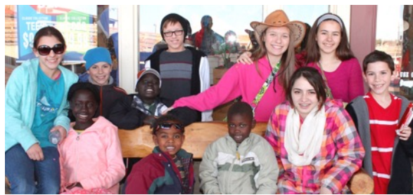
DEAR FL FRIENDS IN TX FOR CHRISTMAS! STILL MAKING MEMORIES