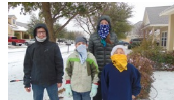
SNOW DAY! CA/FL KIDS IN THE WINTER WONDERLAND